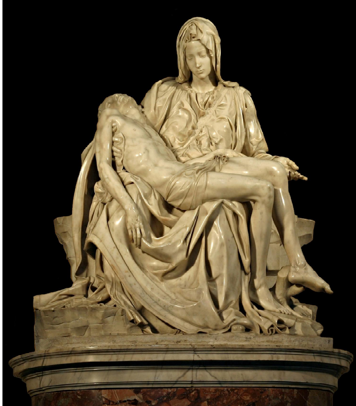
Art of Renaissance