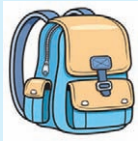
a big bag