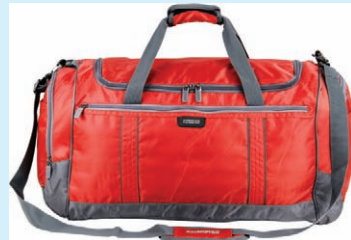
the biggest bag

We can change the words and their meanings by adding suffixes to words at the end. These new words help to compare.