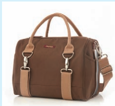
a bigger bag