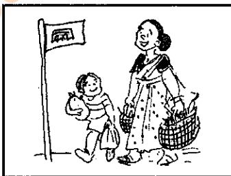
carry, bags, bus stop