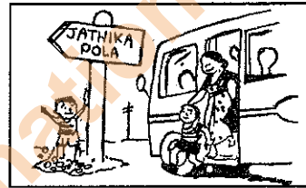
go, fair, mother