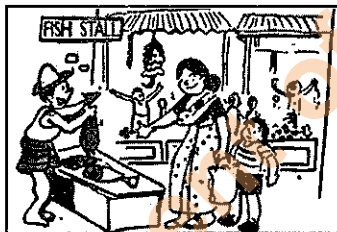
walk, fish stall, mother